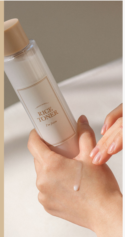
Amazon's Choice Best Toner, I'm From Rice Toner