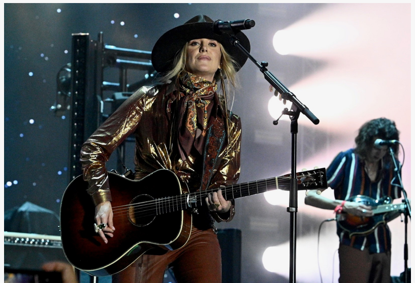
Lainey Wilson