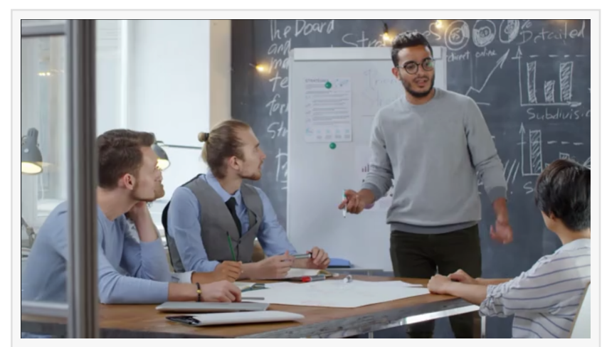
Texas Small Group Health Insurance

This press release can be viewed online at: https://www.einpresswire.com/article/669057736 EIN Presswire's priority is source transparency. We do not allow opaque clients, and our editors try to be careful about weeding out false and misleading content. As a user, if you see something we have missed, please do bring it to our attention. Your help is welcome. EIN Presswire, Everyone's Internet News Presswire™, tries to define some of the boundaries that are reasonable in today's world. Please see our Editorial Guidelines for more information. © 1995-2023 Newsmatics Inc. All Right Reserved.