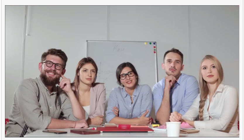
Group Health Insurance in Texas