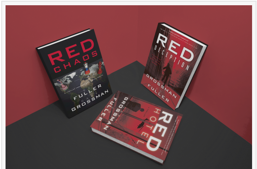
Red Hotel Series - 3 Books

RED CHAOS, along RED HOTEL, and RED DECEPTION are published by Beaufort Books and available in print, ebook, and Audible additions at Amazon, Barnes & Noble or a bookstore near you. To learn more about the RED HOTEL SERIES, the authors, news, and events, go to redhotelseries.com .