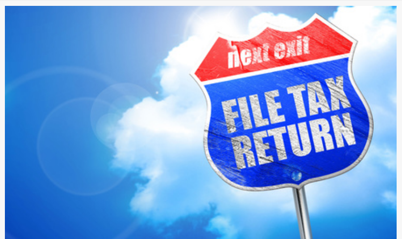
Early Tax Filing

Additionally, filing early can help avoid the rush of last-minute filers and reduce the risk of errors