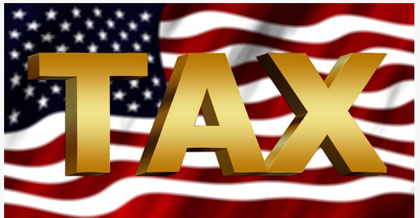
Filing Taxes Early