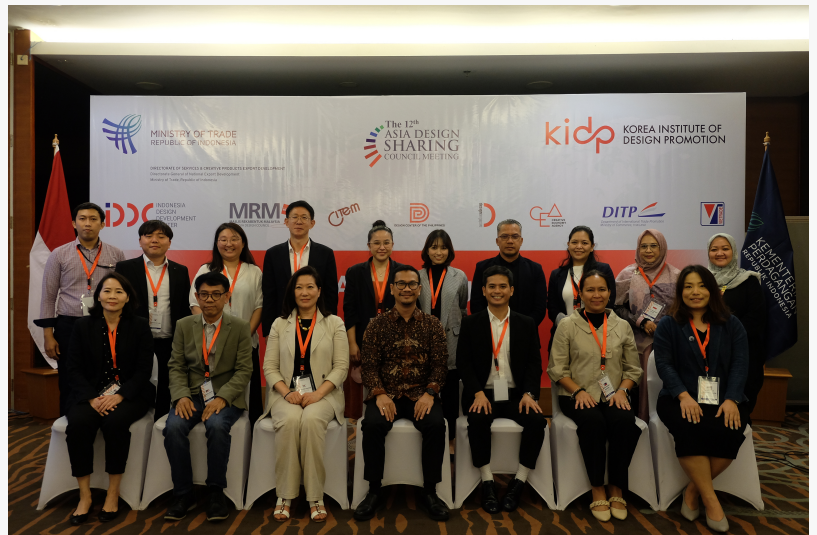
Asia Design Sharing Council Meeting and Seminar 2022 hosted by the Ministry of Trade, Republic of Indonesia