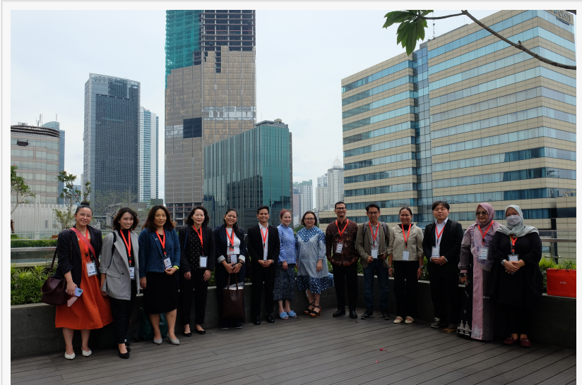
Asia Design Sharing Council Meeting and Seminar 2022 hosted by the Ministry of Trade, Republic of Indonesia

The Design Center of the Philippines introduces the Council's groundbreaking Asian Design Agenda for Climate Change, serving as both the thematic anchor for the event and a unified direction for the Council's