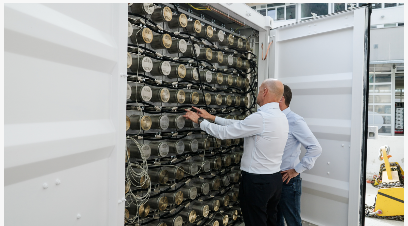
The Safest Hydrogen Storage - Metal Hydride