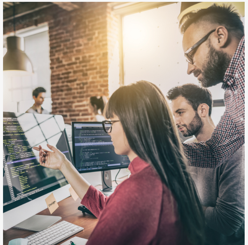
web design and development