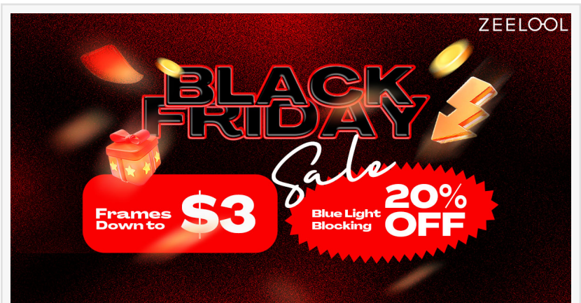
Zeelool pre-black friday sale