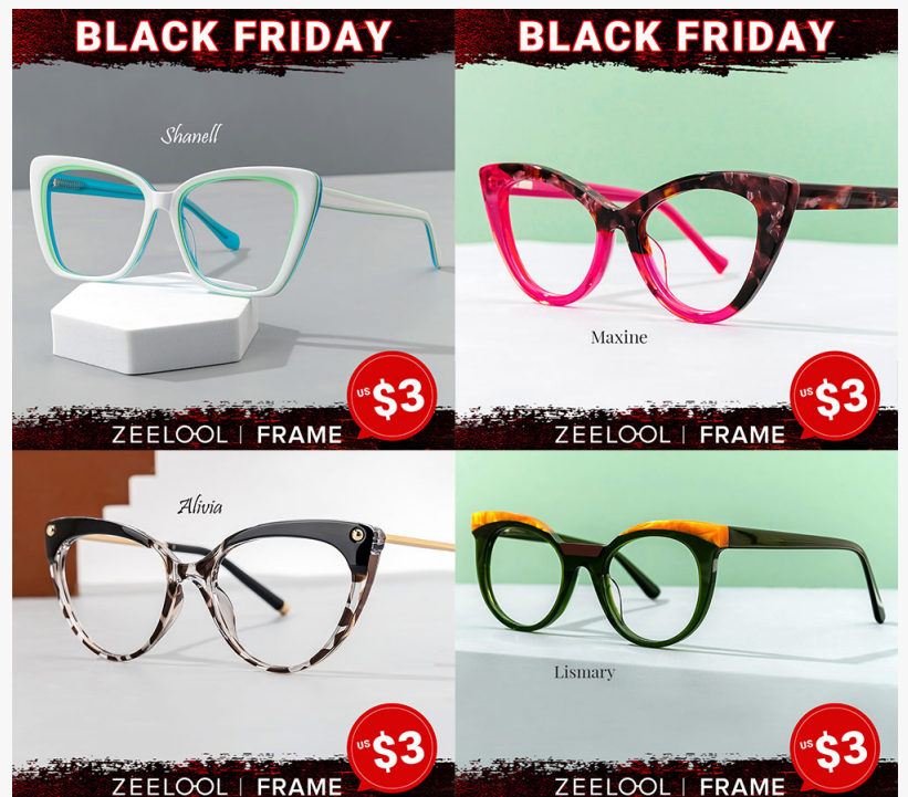
Zeelool frames as low as $3