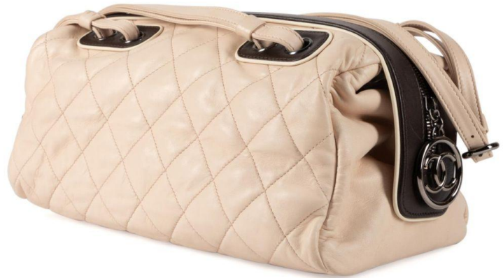
Circa 2006-2009 Chanel cream quilted lambskin Boston Duffel handbag with dark brown trim, gunmetal hardware, "CC" zipper charm and COA card (est. $1,000-$3,000).

Lovely Chanel bags will also be on the Day 1 menu. They will feature a 2006-2009 Chanel cream quilted lambskin Boston Duffel handbag with dark brown trim, gunmetal hardware, "CC" zipper charm and COA card (est. $1,000-$3,000); and a Chanel black quilted satin and gold tone flap evening bag, circa 1986-1988, with repeating "CC" logos, red leather interior and box (est. $1,000-$2,000).