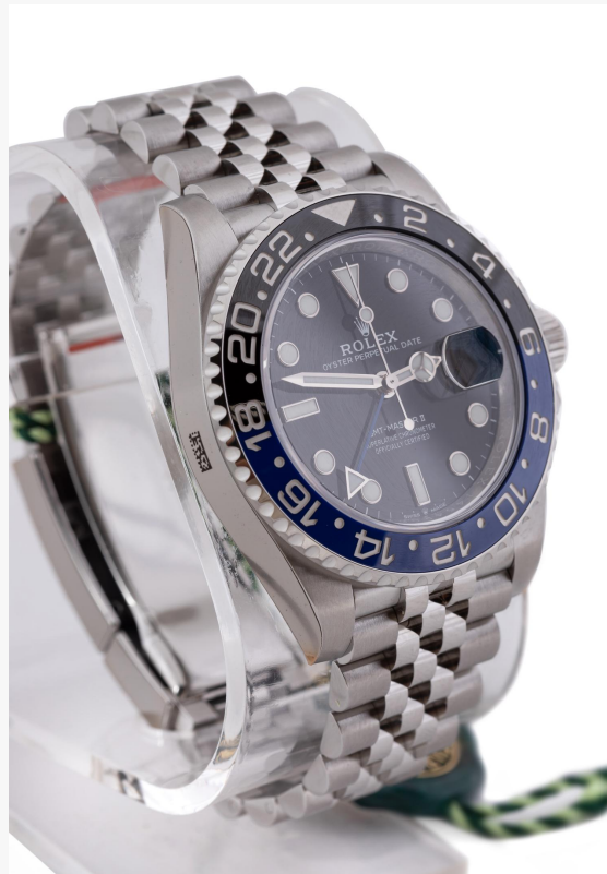
Two never-worn Rolex watches have identical $18,000-$22,000 estimates. One is this 2019 Oyster Perpetual date GMT Master II "Batman" stainless steel watch with tags, cards, papers and boxes.