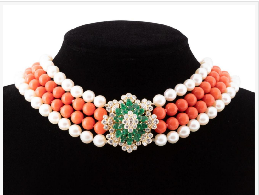
Cartier coral, pearl and 18kt gold quadruple-strand necklace from 1976 with two strands of spherical orange red coral beads flanked by two strands of white bodied cultured pearls (est. $10,000-$15,000).

A diamond and platinum ring having one marquise cut brilliant faceted diamond weighing 3.72 carats, with SI-2 clarity and J color, flanked by two triangular cut brilliant faceted diamonds of SI-1 clarity and G/H color, weighing 1.50 ctw, with a GIA Diamond Grading Report,