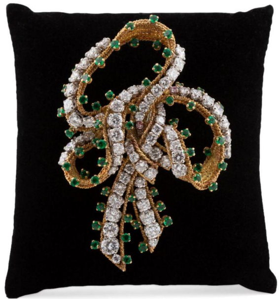
Circa 1969 Tiffany & Co. gem set 18k yellow gold bow brooch having 72 round brilliant cut diamonds weighing 10.16 ctw, and 60 round cut bright green emeralds weighing 3.82 ctw (est. $10,000-$20,000).

All the items described so far are in the Day 2 session, but Day 1 should not be ignored. It will be led by fine creations by David Yurman (American, 1980). Tops among these is an Albion Collection diamond and 18k yellow gold pendant and necklace, the pendant having 51 round brilliant cut diamonds of VS-1/VS-2 clarity and F/G color, weighing a total of 0.60 ctw (est. $2,700-$5,000).