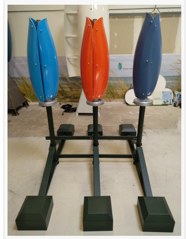
Colored EcoRoof Energy Hub