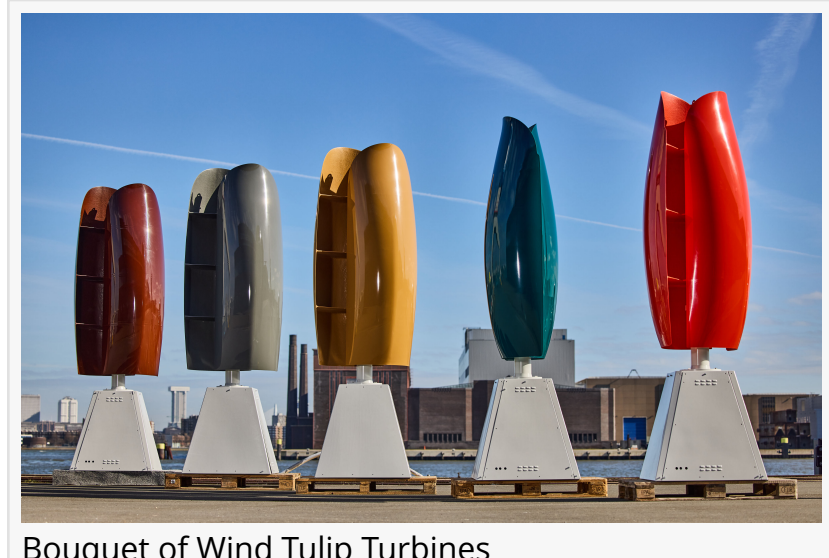
Bouquet of Wind Tulip Turbines

Facebook Twitter LinkedIn Instagram YouTube Other