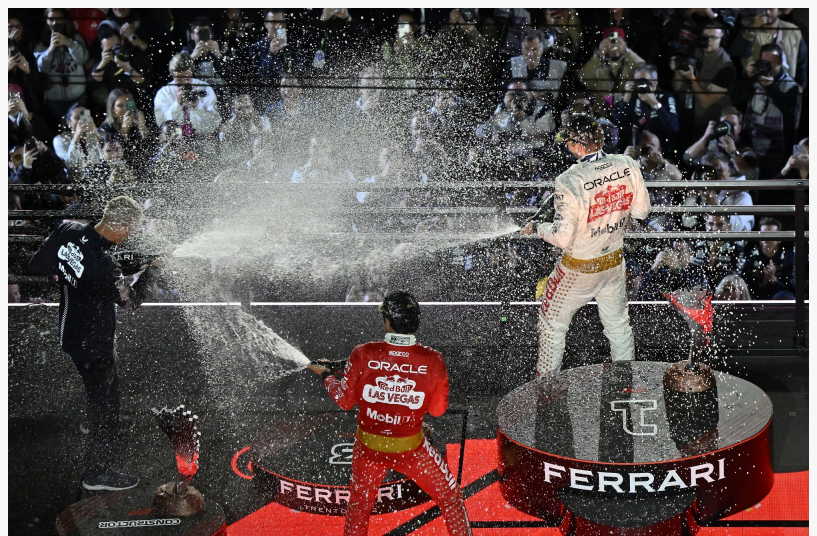
F1 winners spray sparkling wine