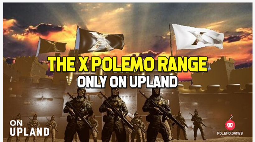
The X Polemo Range

EINPresswire.com/ -- Polemo Games has officially launched its gaming platform in Upland with its first mini-game, the X Polemo Range. The Web3 social gaming platform brings together the worlds of Web2 gaming, military, and tactical lifestyle cultures with the cutting-edge advancements of Web3 technology. □