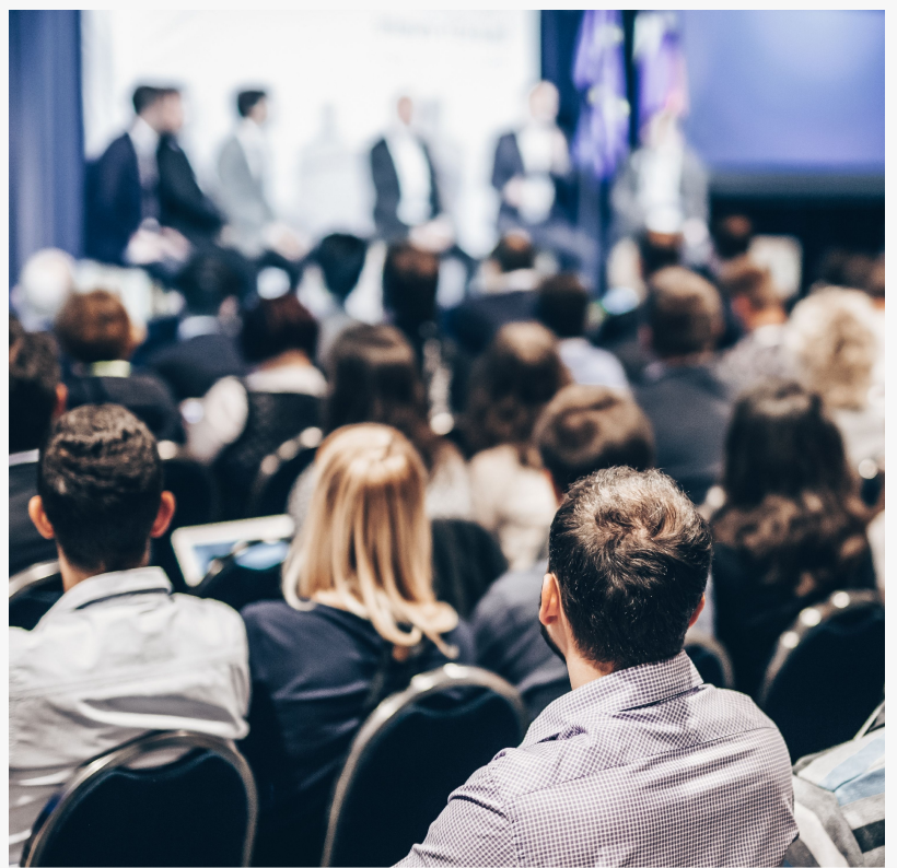
Entrepreneurs Meeting at a Conference

As the week comes to an end, it's worth reflecting on the impact of the activities that took place