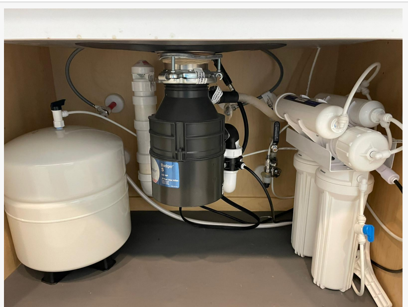
Reverse Osmosis in Port St Lucie

The expansion marks an important milestone for a company with a fifteen-year history of service in Port St Lucie. Eastern Water and Health looks forward to introducing its high-quality solutions to new communities throughout the Treasure Coast region. Customers in Fort Pierce, Stuart and beyond can now rely on the business as their trusted local resource for resolving water issues large and small. Eastern Water and Health remains committed to its founding principles of superior service, environmental responsibility and empowering healthier, safer water for the entire Treasure Coast community.