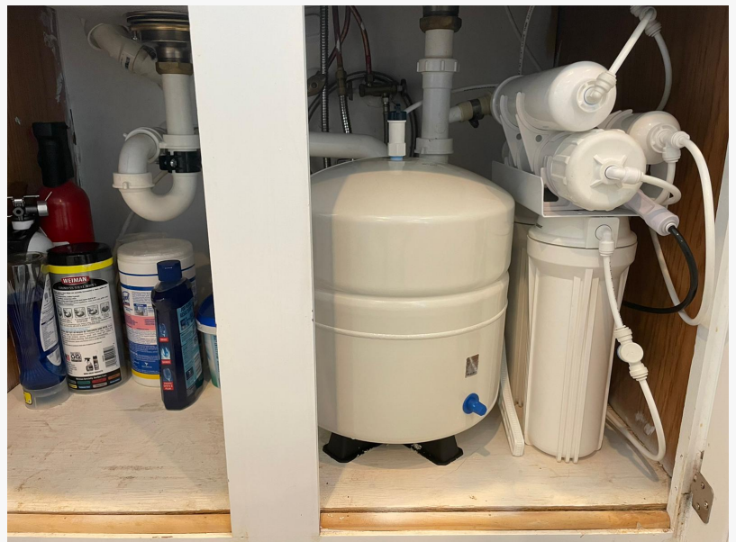
reverse osmosis install