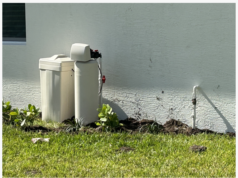
installation of softener in Port St Lucie

The expansion introduces Eastern Water and Health services to customers across St. Lucie, Martin and Indian River counties. Business owner expressed his enthusiasm, stating "We have been proud to serve the Port St Lucie community. However, we recognize clean, safe water should not end at any county line. It is time to extend our commitment to water quality throughout the Treasure Coast."