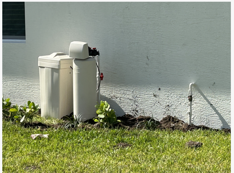
Mixed Bed Water Softener/Conditioner