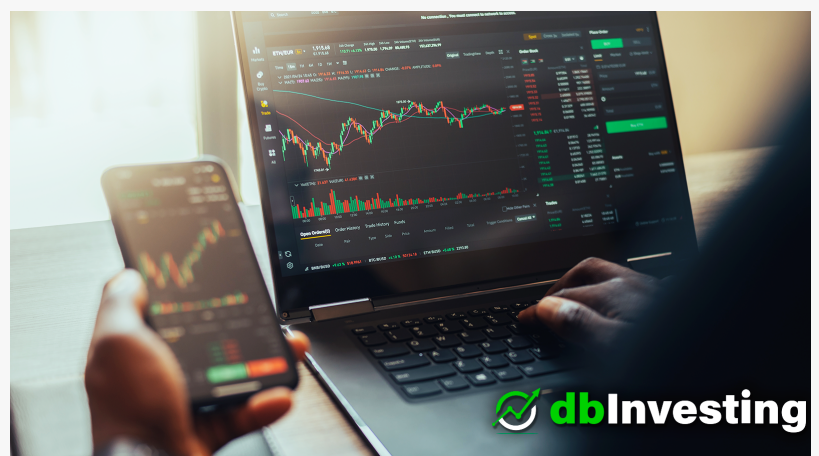
Retail FX broker DB Investing