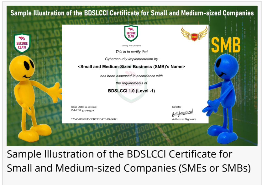
Sample Illustration of the BDSLCCI Certificate for Small and Medium-sized Companies (SMEs or SMBs)

EINPresswire.com/ -- On November 30, 2023, observe National Computer Security Day by making sure all electronic devices are protected against cyber threats at personal or professional environment. This unique day was established in 1988, marking the beginning of global recognition for the significance of computer security. It is more important than ever for us all to remain knowledgeable about online safety measures.