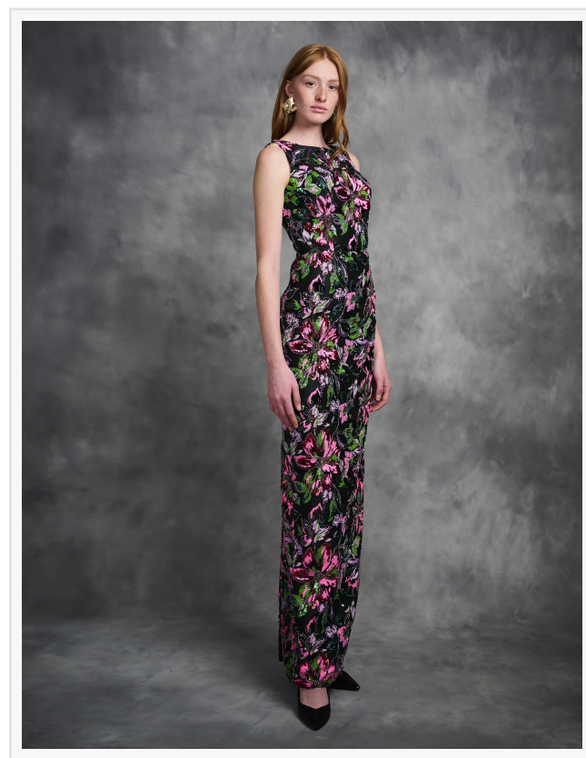
Flower Beaded pencil dress by Guillermo Pharis

This press release can be viewed online at: https://www.einpresswire.com/article/669803912