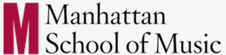
Manhattan School of Music Logo