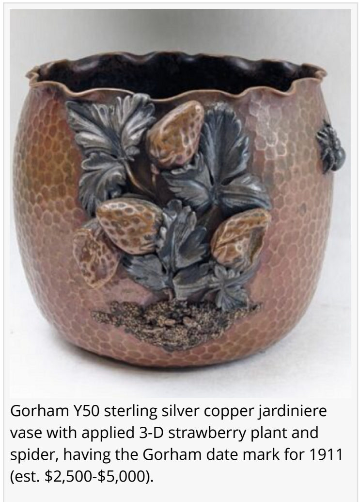
Gorham Y50 sterling silver copper jardiniere vase with applied 3-D strawberry plant and spider, having the Gorham date mark for 1911 (est. $2,500-$5,000).

Also up for bid is a Tootsie Toy four-vehicle Fire Department set of die-cast metal toys, with box (est. $500-$750); An American Flyer 20535 S Pony Express passenger set, including a diesel and two passenger cars ending number 37 and 38 and featuring metal trucks, metal wheels and