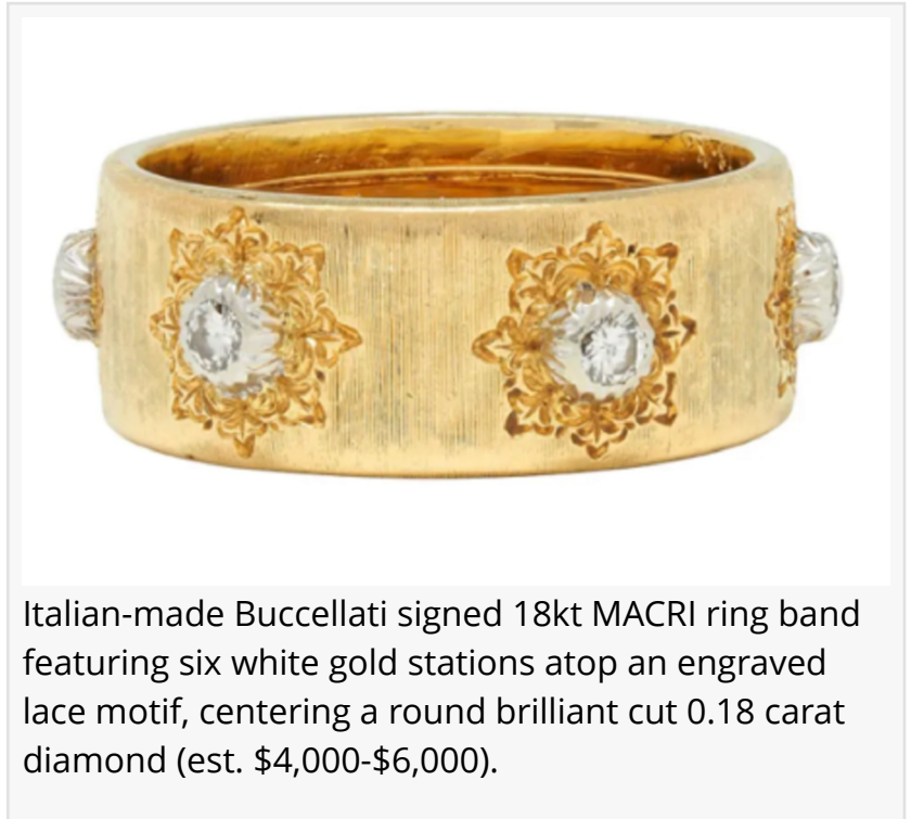
Italian-made Buccellati signed 18kt MACRI ring band featuring six white gold stations atop an engraved lace motif, centering a round brilliant cut 0.18 carat diamond (est. $4,000-$6,000).

EINPresswire.com/ -- With the holidays fast approaching, SJ Auctioneers is the place to find that perfect gift for that special someone, young and old alike. The firm will host an online-only Silverware, Toys, Décor and Glass Art auction on Friday, December 15th, starting at 6 pm Eastern time. Rest assured, winning bidders will have their items arrive in time for the holidays.