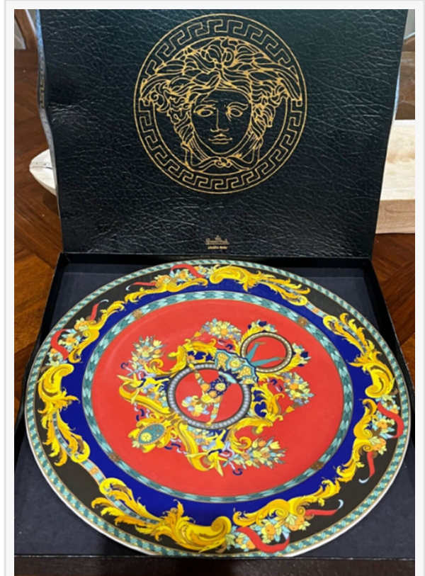
Nice set of two Versace Le Roi porcelain charger service plates with box, made in Germany, each plate 12 ¼ inches in diameter (est. $1,500-$3,000).

SJ Auctioneers is always seeking quality items for future auctions. To inquire about consigning an item, an estate or a collection, you may call 646-450-7553; or, you can send an email to sjauctioneers@gmail.com . To learn more about SJ Auctioneers and the online-only Silverware, Toys, Décor and Glass Art auction slated for Friday, December 15th, starting at 6 pm Eastern time, please visit www.sjauctioneers.com . Updates are posted often.