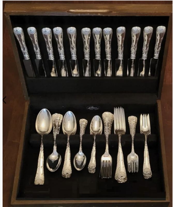
Tiffany sterling silver Wave Edge flatware set for 12, with case, including 60 pieces of flatware, with no monograms, stamped "Tiffany & Co. Sterling" (est. $3,500-$5,000).

Also offered will be a Swarovski signed chess set game, clear and black, with the original box, including crystal pieces, game board and storage case (est. $1,000-$1,500); a signed Edward Hald Orrefors fish designed cased glass vase standing 5 ½ inches tall, in excellent used condition (est. $500-