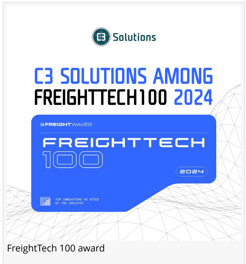
FreightTech 100 award

This press release can be viewed online at: https://www.einpresswire.com/article/669975369