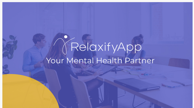
Mental health partner

"It has been a magnificent experience, we have had a chance to meet so many interesting people in the world of finance and investments and we have