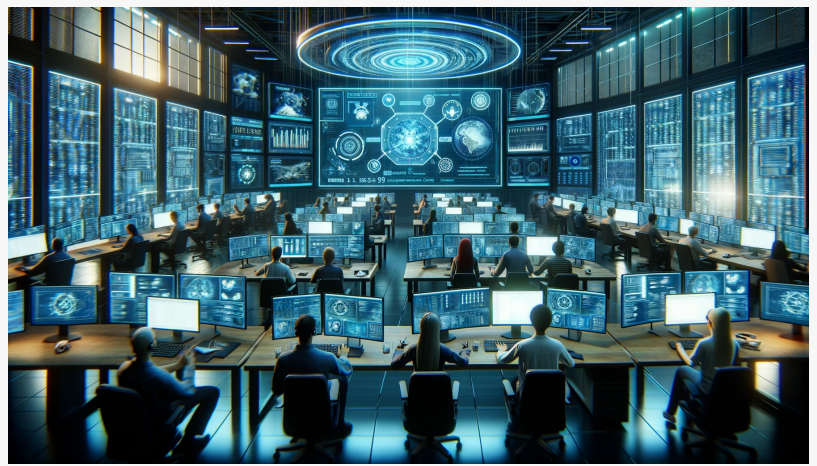
Security Operations Center (SOC)

• Darktrace DETECT™ analyzes thousands of metrics to reveal subtle deviations that may signal an evolving threat, including unknown techniques and novel threats.