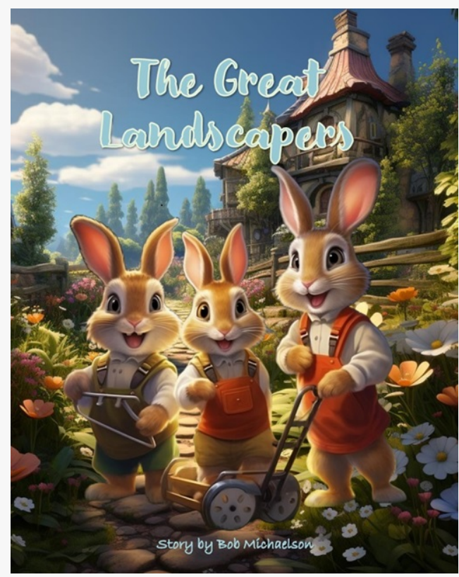
Cover of "The Great Landscapers"

What began as a story two years ago blossomed into a full-fledged book, leveraging AI tools to