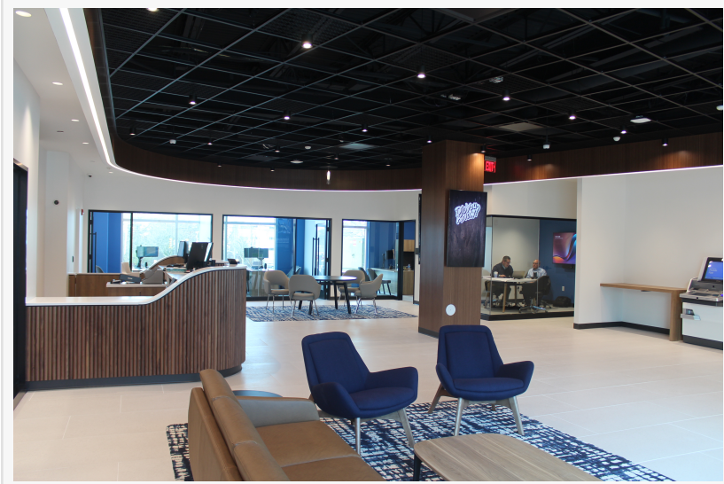
Inside the new Brentwood Bank Wexford branch and regional office

This press release can be viewed online at: https://www.einpresswire.com/article/670079184