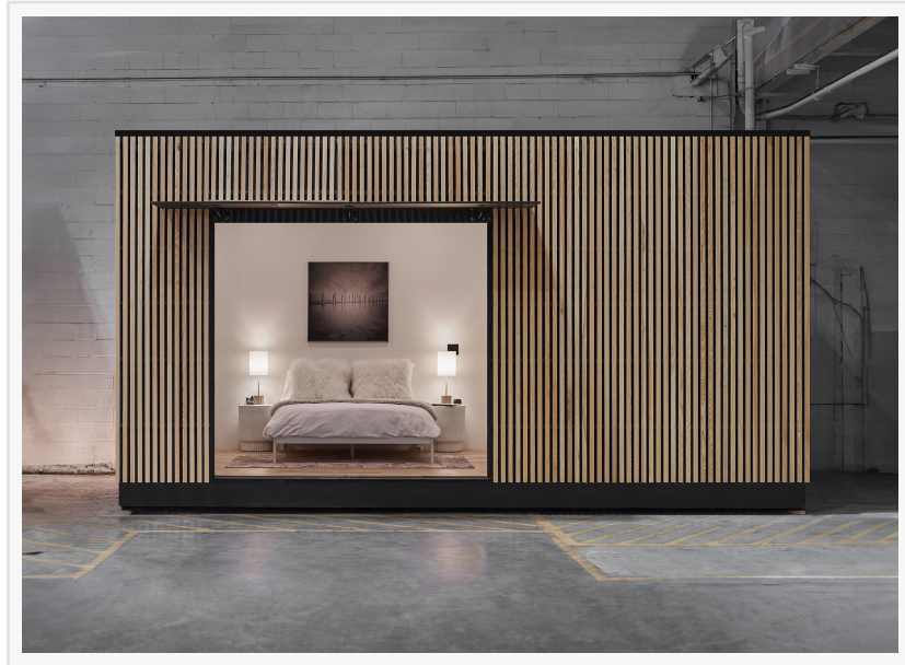
New Tomu Junior Villa starting at $85,000

2. New Villa Collection Model: The new Tomu Junior Villa joins the predesigned Villa Collection as the smallest option within Tomu's prefab lodging offering. Featuring a main space able to fit a king-size bed, full bathroom with walk-in shower, and kitchenette in 253 Sq Ft, the new model was designed for more diverse applications, from residential ADUs to more prototypical guest room layouts. Its single-module construction means the model arrives fully complete and can be installed within a day. A variant floor plan will also be available to commercial clients for Bespoke Projects that can be used to create adjoined multi-unit guest room blocks.