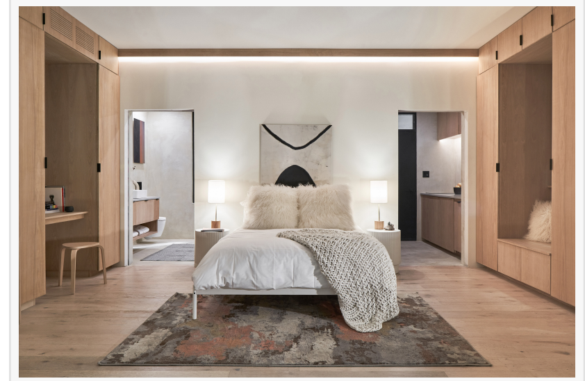
Tomu Studio Villa starting at $145,000