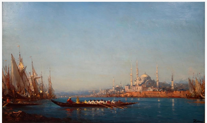
Oil on cradled mahogany panel by Felix Ziem (French, 1821-1911), titled Sultan's Caique at Constantinople, signed, 25 ¾ inches by 38 ¼ inches as framed (est. $5,000-$8,000).

Fans of china and porcelain will not be disappointed. Herndon, the Hungarian-based manufacturer, will feature china in the Rothschild Bird pattern (est. $1,000-$2,000) and the Blue Garland pattern (est. $600-$1,000). Also offered will be a late 19th/early 20th century Japanese Hirado porcelain bowl with cover, 3 ½ inches tall (est. $300-$600); and two 18th/19th century early Staffordshire pearlware covered sugar bowls (est. $300-$500).