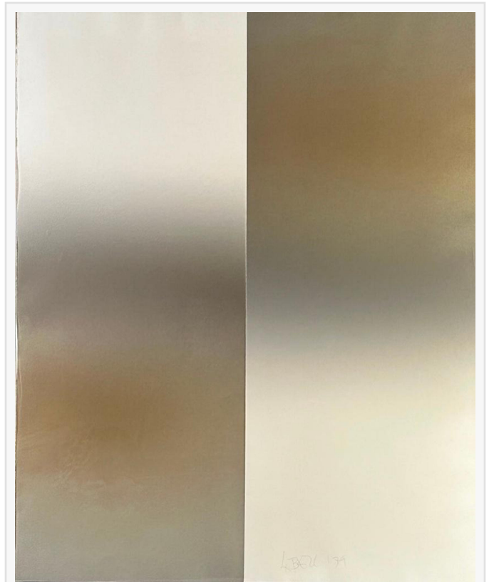
Vaporized metal pigments on paper by Larry Bell (American, b. 1939), titled Vapor Drawing (1979), signed and dated, 47 ½ inches by 38 ½ inches (est. $6,000-$8,000).

seven modular sections, upholstered in the original cotton velvet and massive at 156 inches long (est. $2,000-$4,000); and a three-panel room divider from the 1920s or ‘30s, the black ground decorated with colorful geometric shapes, and having a pattern of silver painted stripes, the