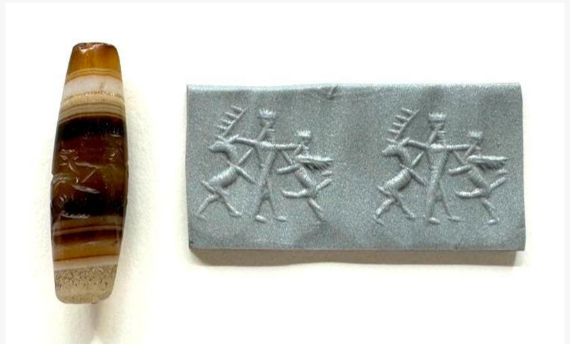
Achaemenid cylinder seal, circa 450-350 BCE, banded agate of a convex shape, carved in the "cut style", depicting an Achaemenid king holding off a stag, 48 mm x 14 mm (est. $500-$900).