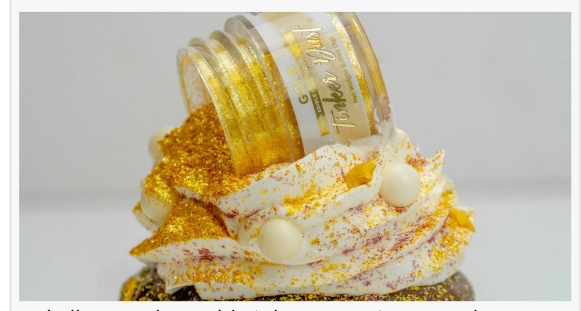
Bakell's popular Gold Tinker Dust gives any dessert or treat a unique shine!

Gold Tinker Dust dusted on the new 'Caramel Glitter Popcorn' by Popscorn, available in Regals Cinemas nationwide for the Disney 'Wish' release.