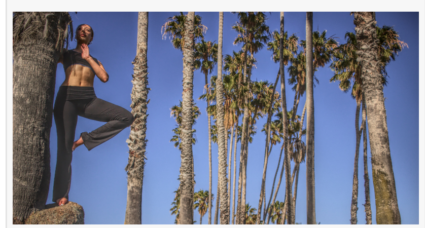
Save 20% and plant a tree with Chickfly's 2023 Black Friday, Cyber Monday and Giving Tuesday

The bodice works great, either bra-less or with a black bra chosen to match the style. Chickfly's Butter Onesie is made with soft, strong, stretchy, and sustainable bamboo fabric, colored with organic dyes. It contains 8% added spandex for stretch and shape retention. The bamboo fabric is breathable, wicking, colorfast, and odor-resistant.