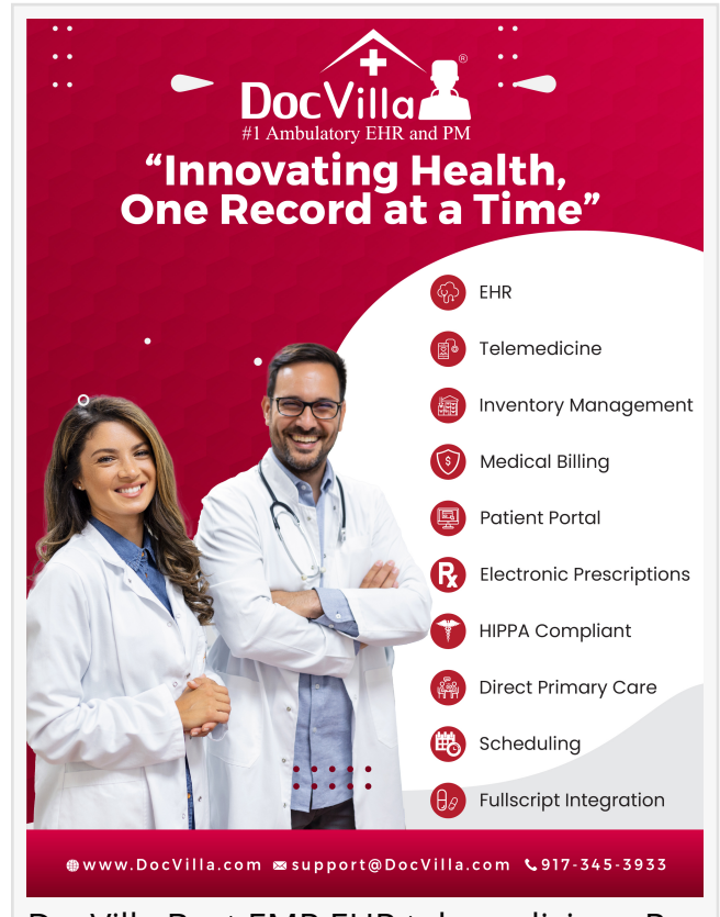
DocVilla Best EMR EHR telemedicine eRx Practice Management software for independent medical practices

DocVilla's newest feature introduces an intuitive and user-friendly way for patients to complete comprehensive medical forms using their personal devices such as laptops and smartphones. This