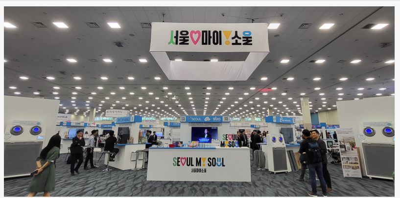
The 21st World Korean Business Convention

With significant recognition, having received the Bronze at the 2023 Edison Awards and an innovation award at CES in 2022, Wayne Hills Bryant A.I. has established itself as an emerging unicorn company in the AI technology sector. These accolades underscore the company's exceptional technological capabilities and highlight their potential for growth and transformation in the industry.