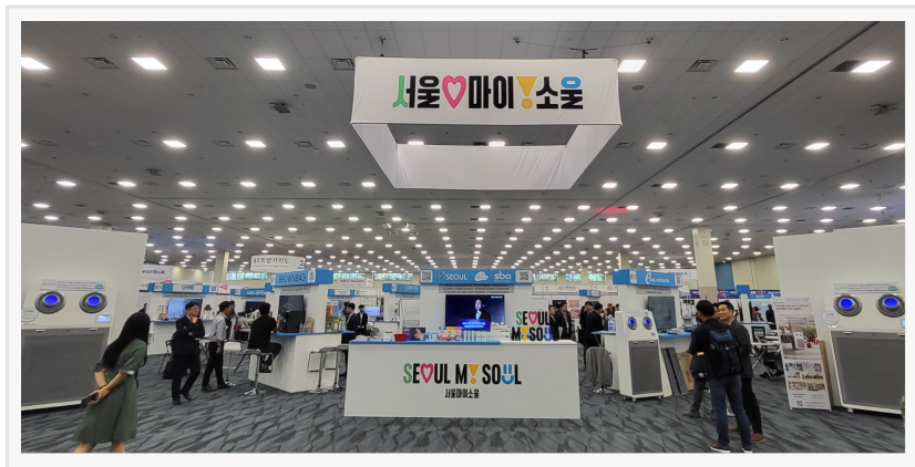
The 21st World Korean Business Convention

CORNERS was founded with a mission to provide vital real-time information when needed the most in critical situations, where human intelligence alone may fall short. By developing and implementing "Smart Evacuation Safety Solutions" designed to deliver real-time information tailored to specific locations and circumstances during unforeseen emergency situations, CORNERS initiated the digital transformation of fire safety.