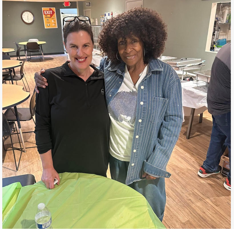
"We Expect Miracles"

This press release can be viewed online at: https://www.einpresswire.com/article/670614426