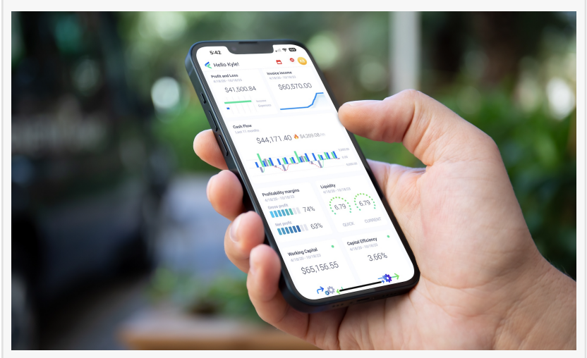
Fiskl AI Accounting on Mobile

Fiskl's triumph at this prestigious event is a powerful endorsement of its pioneering role in reshaping the FinTech sector with advanced AI technology. At the heart of Fiskl's success is its