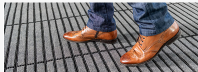
Entrance Matting Systems

enhancing corporate identity and building brand awareness.