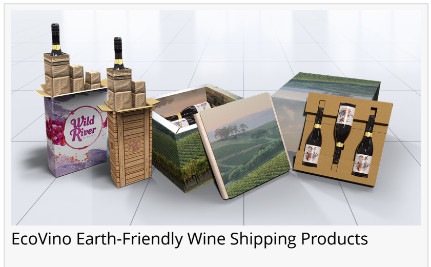
EcoVino Earth-Friendly Wine Shipping Products