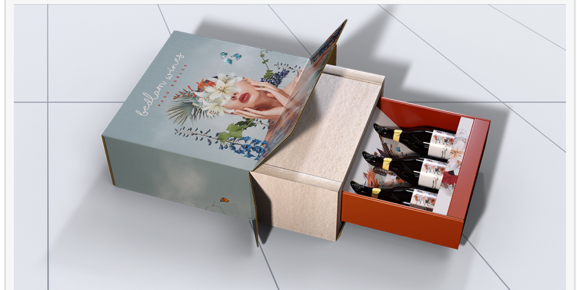
EcoVino CruzPak Premium Wine Shipper