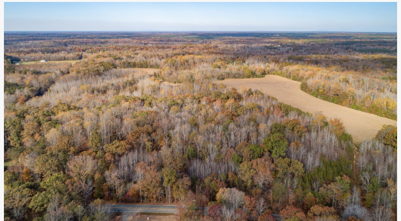
5304 Partlow Rd., Partlow, VA 22534 (Spotsylvania County)