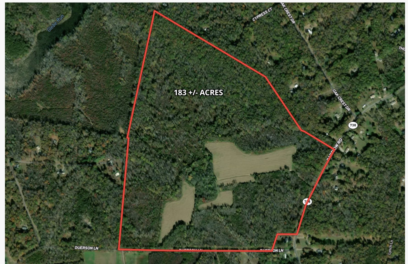
5304 Partlow Rd., Partlow, VA 22534 (Spotsylvania County)