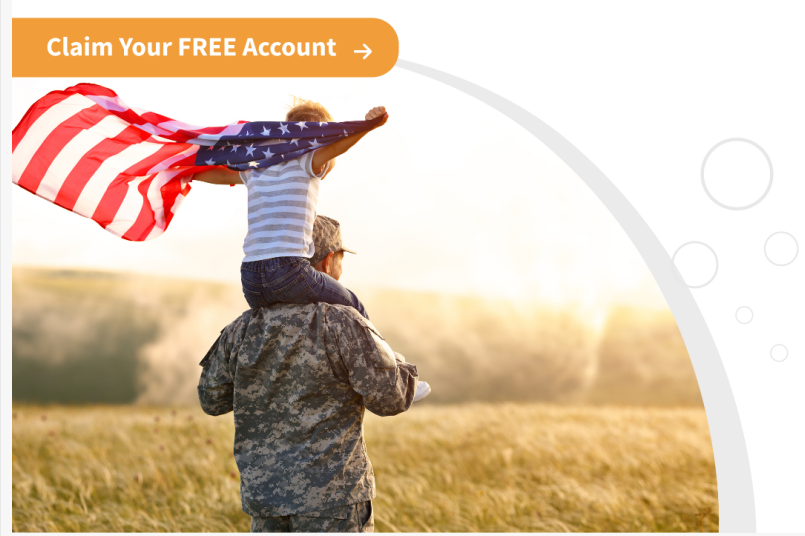
Launch Cart supports veteran entrepreneurs by offering complimentary lifetime access to its $297 monthly eCom Scale plan. This underscores Launch Cart's commitment to empowering veterans in the digital marketplace for financial independence.

commerce. Launch Cart focuses on print-on-demand services, allowing users to initiate and expand their businesses without upfront investments in inventory or fulfillment concerns. This initiative is designed to thank the veteran community for their service and unwavering dedication.