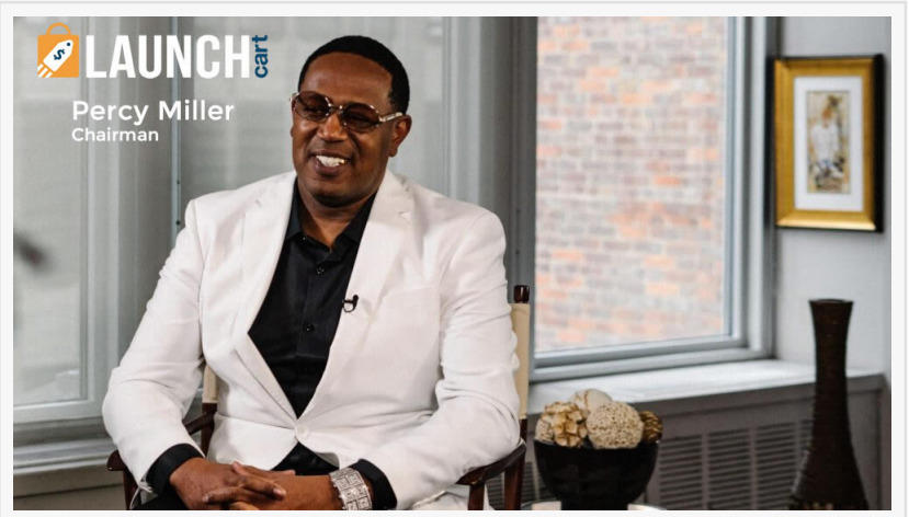
Master P, Launch Cart's Chairman, recognizes veterans' sacrifices, "This initiative reflects our gratitude and belief in their entrepreneurial potential. We're dedicated to providing tools and support for success in the dynamic e-commerce and digital marketplace".

This initiative goes beyond providing free access; it aims to create a supportive ecosystem for veteran entrepreneurs. Launch Cart's platform is backed by a robust support system, educational resources, and a community of like-minded individuals, all contributing to the fostering of success in e-commerce.