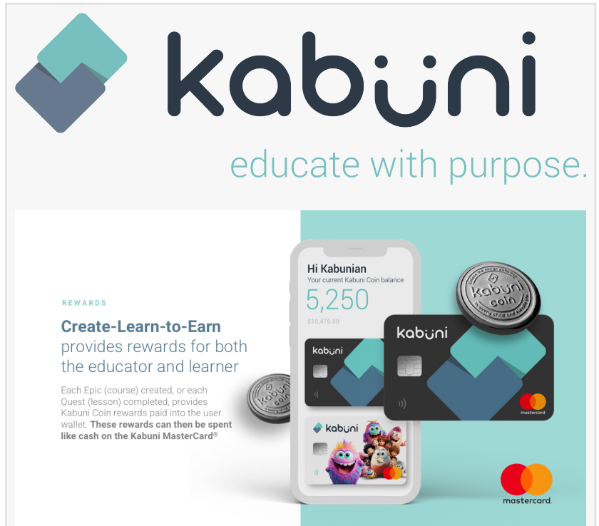
Kabuni CARD powered by MasterCard

Kabuni WIZARD provides a solution for the education system that needs help to keep pace with rapid advancements seen in other industries. Using AI (Artificial Intelligence) and blockchain technology, the platform nurtures an active learning environment regardless of geographic location.