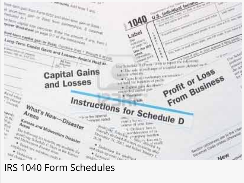
IRS 1040 Form Schedules