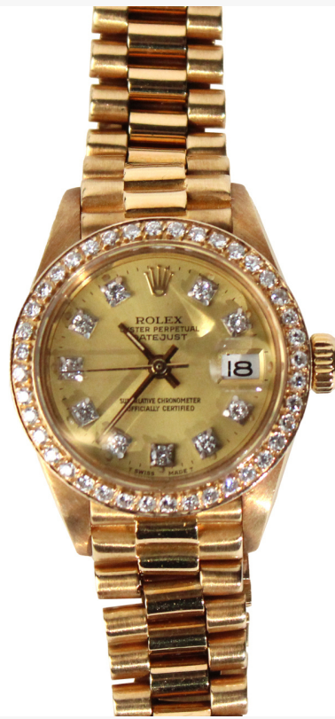
Rolex 18k rose gold and diamond Oyster Perpetual Date ladies' watch with Presidential band (est. $8,000-$12,000).

Finally, for those that are musically inclined, there is a nicely curated selection of musical instruments highlighted by a 1948 D'Angelico Excel guitar that's only been used by one owner and has been lovingly cared for (est. $12,000-$18,000). There is also a Gibson model ES-175TD (prototype) guitar made circa 1970. This is coming from the same collection as the D'Angelico.