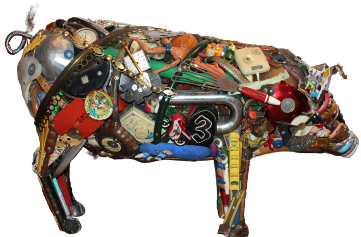
Leo Sewell (American, b 1945), found object sculpture of a pig.