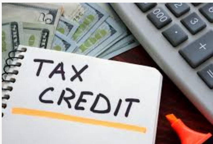
Additional Child Tax Credit