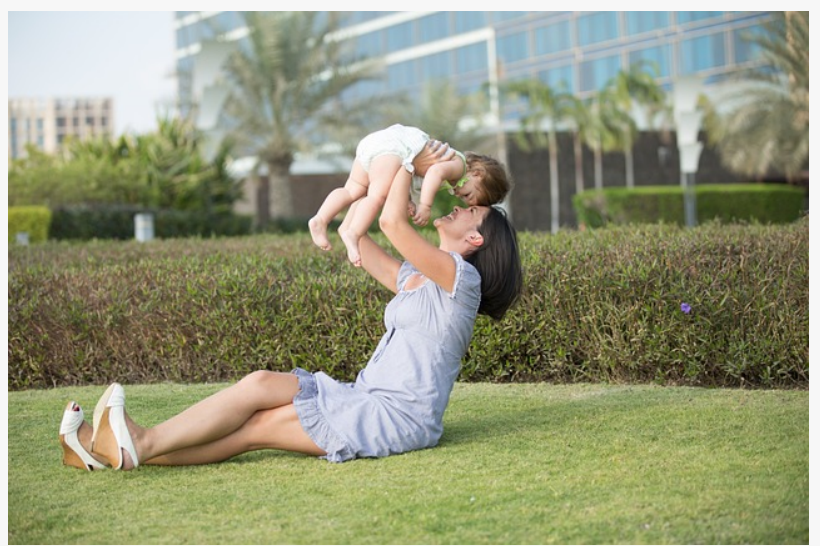
Child Tax Credit Qualifications

Completing Form 8812: Taxpayers using Form 8812 will find it essential to carefully follow the instructions provided by the IRS. The form guides taxpayers through the process of calculating the additional credit, ensuring accuracy and compliance with IRS guidelines.