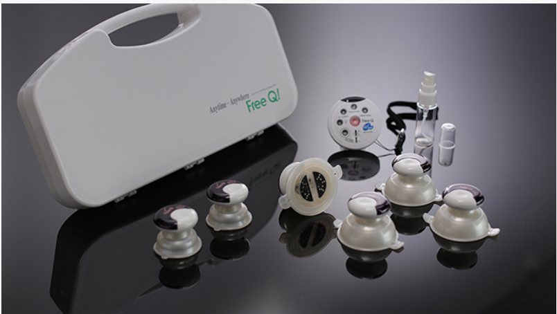
Free Q: A Wireless Revolution in Healthcare