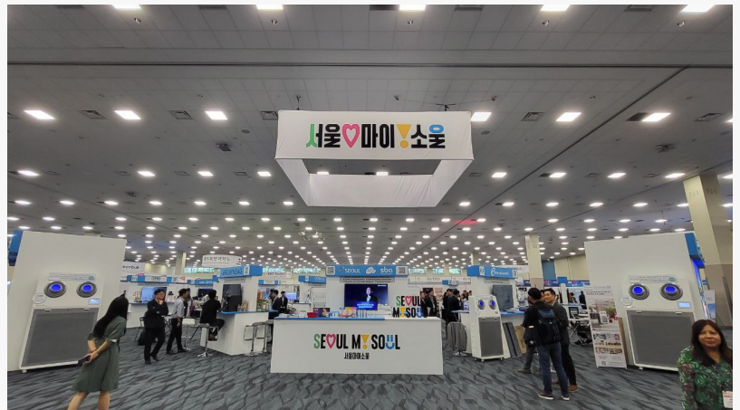
World Korean Business Convention