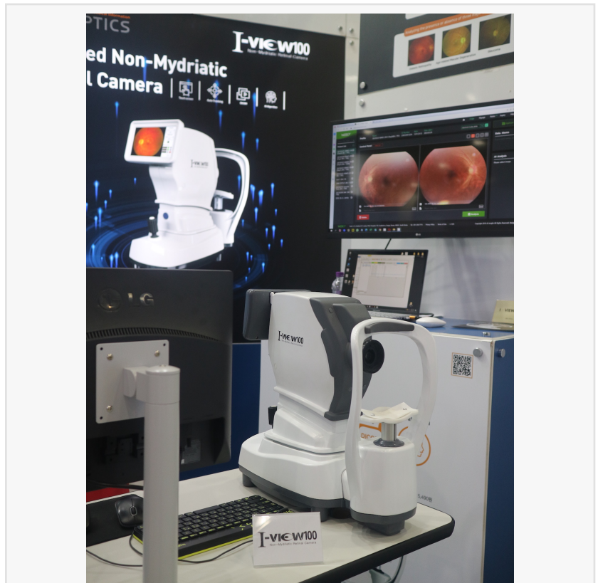
I-VIEW100®, an AI-Powered Retina Camera

The I-VIEW100® aligns with the global trend of incorporating AI into healthcare, catering to the United Nations Sustainable Development Goals (SDGs) 3.4, emphasizing health and well-being. UMI Optics aspires to contribute to preventing blindness through its "3 Major Sight-Threatening