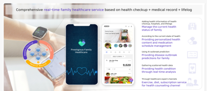
Unlocking Health Excellence: DKI's PFH (Prestigious Family Healthcare)