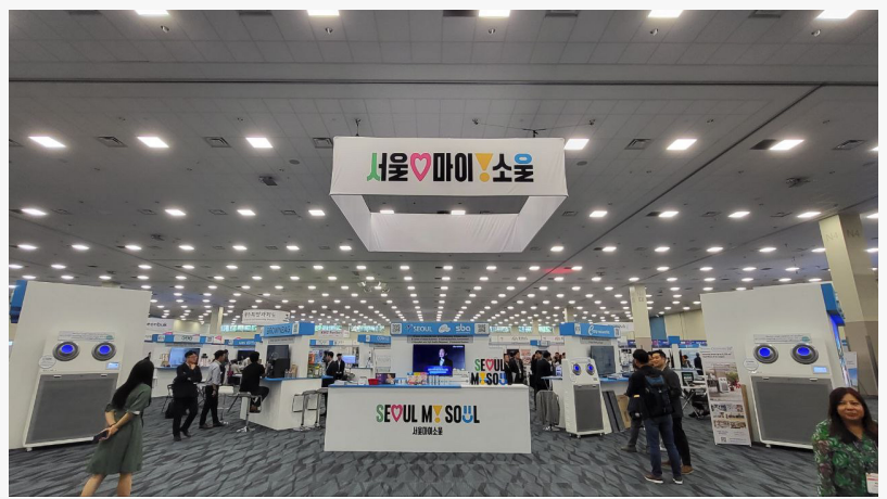
World Korean Business Convention

PFH offers a paradigm shift in family healthcare, providing a centralized platform for users to create family channels, share vital health metrics, and monitor real-time health status. The app not only prevents medication misuse but also employs advanced AI algorithms to predict severe diseases, a critical feature for enhancing early detection and prevention strategies.