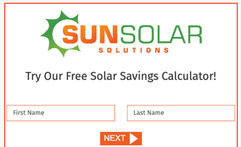
SUNSOLAR SOLUTIONS Solar Calculator

The SUNSOLAR SOLUTIONS knowledgeable and experienced team provides comprehensive energy consultation, design, engineering, installation, and service for solar systems. Offering the best technology, design and craftsmanship, the systems that they provide are designed by solar engineers and are installed using an 8-step process that is "roofing approved" which enables them to offer a 25-year roof penetration and workmanship warranty.