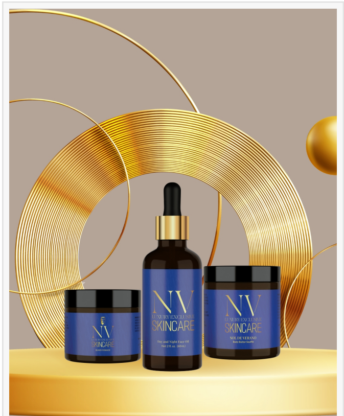
NV Luxury Exclusive Skincare

This press release can be viewed online at: https://www.einpresswire.com/article/671309844