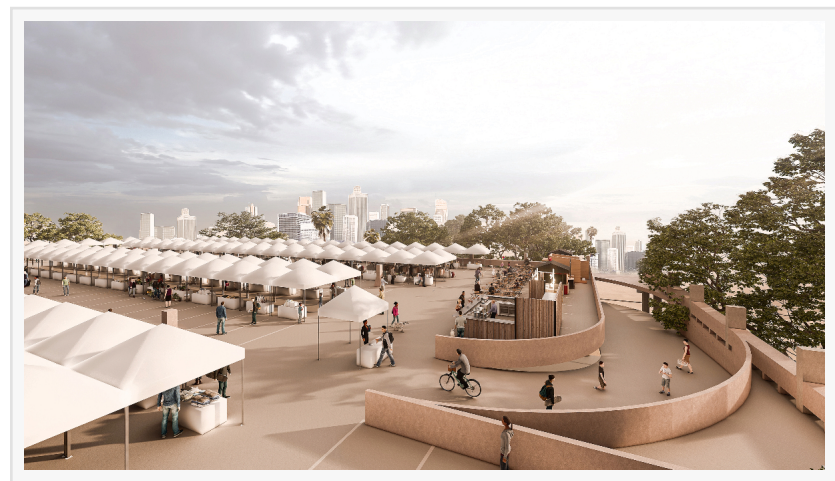
Views from ABove