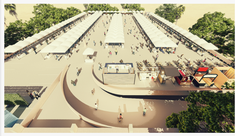
View from Above

Vintage Land, with its expansive and versatile space, offers an ideal new home for the Los Feliz Flea. This innovative location will provide an enhanced experience for vendors and visitors alike, featuring over 200 sellers, live music, DJs, and a full bar. The addition of Sundays to the market schedule further enriches the community's opportunity to engage with the vibrant culture and offerings of the flea market.