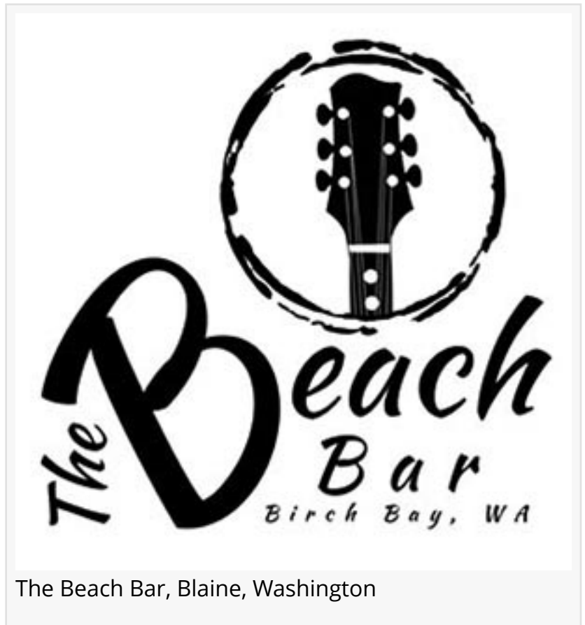
The Beach Bar, Blaine, Washington

Furthermore, Sheriff emphasized that the name change better reflects the true essence of the establishment. "We are a beach bar with good food, set on the shore of beautiful Birch Bay. The