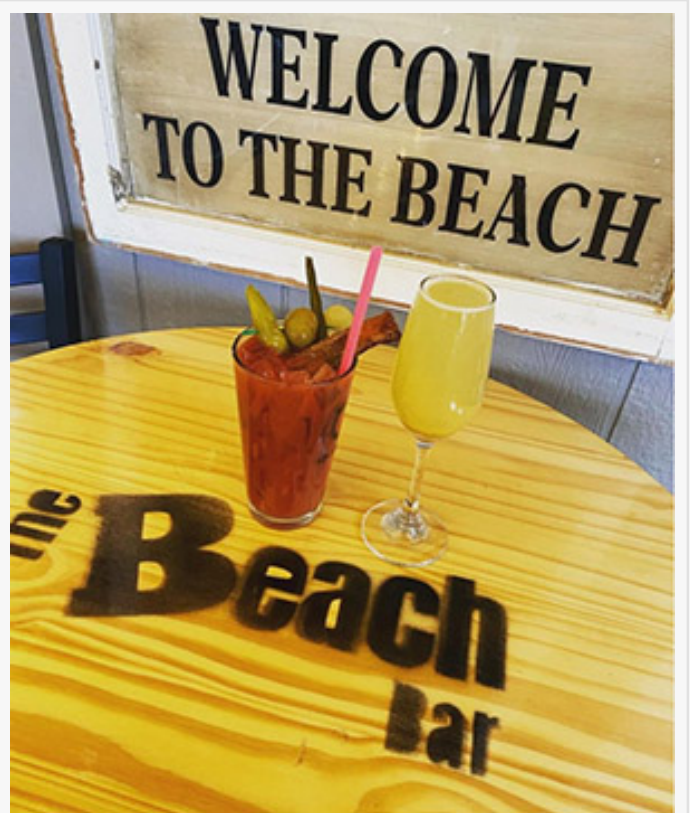
Welcome to the Beach - The Beach Bar on Birch Bay

This press release can be viewed online at: https://www.einpresswire.com/article/671340172