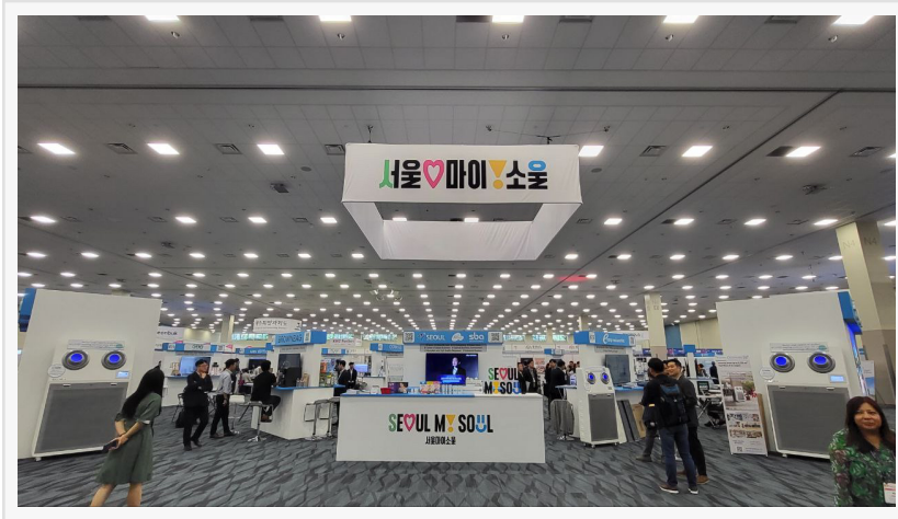
World Korean Business Convention

Having participated in various events, the company's objective has been to secure valuable partnerships, particularly with furniture manufacturers and distributors in the